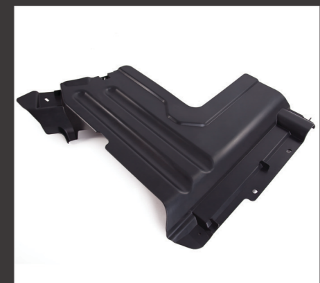
DEFLECTEUR SOUS RESERVOIR G+D A7

Client: TrendTool Dim.Mold 1096 x 696 x 573