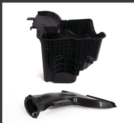
CUVE + COUVERCLE RESOUNATEUR BVH3/EP6C

Client: Peugeot / Citroën Dim. Mold: 1290 x 1015 x 920