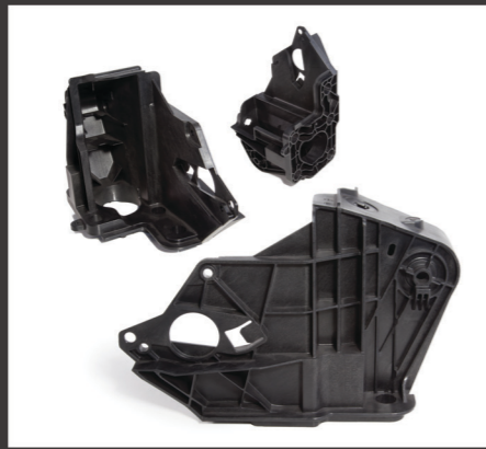
CHAPE DE PEDALE DE FREIN DAG W62

Client: Renault Dim. Mold: (2X) 680 x 646 x 403