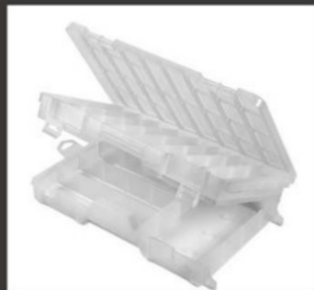
2 NEVEIS BOÎTE