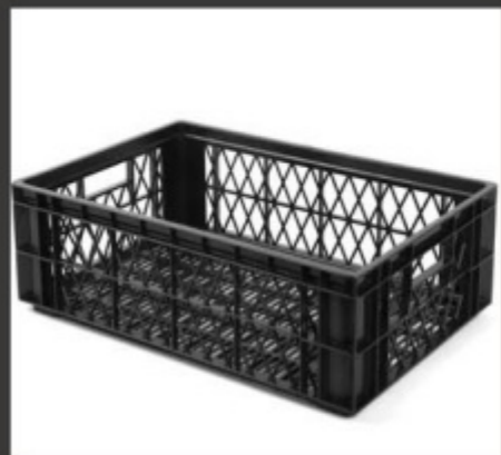
CAISSE À POULETS