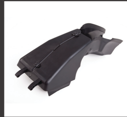
ECOPE BK91 (BI INJECTION) ( ÉCLUSE )

Client: Peugeot / Citroën Dim. Mold: 680 x 820 x 551