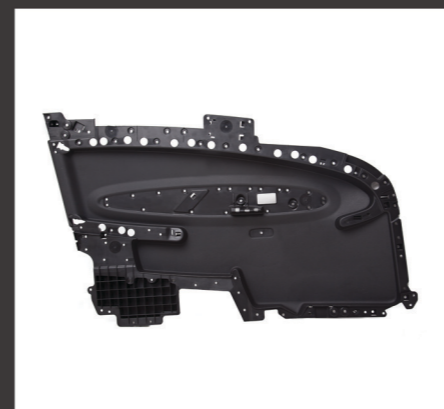
INSERT FRONT RH

Client: Trelleborg Dim. Mold: 1076 x 946 x 782