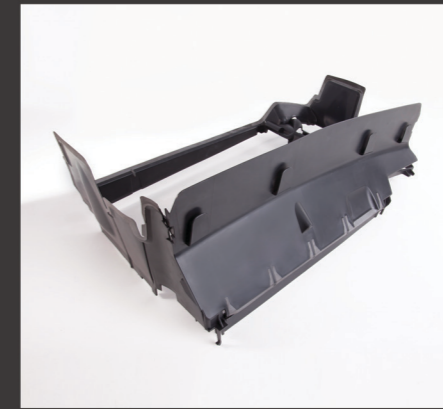
GUIDE-AIR-NCLIM-A32-X61 (INSERT + SURMOULAGE)

Client: Renault Dim.Mold: 910 x 862 x 797