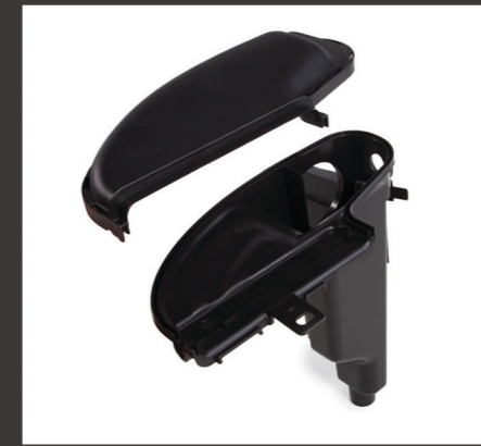
DÉFLECTEUR D'EAU EP6 CDT

Client: Renault Dim.Mold: 846 x 696 x 839