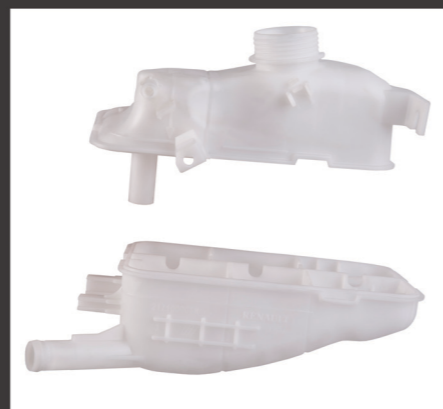
BOITE DE DÉGAZAGE L38

Client: Carbody Dim. Mold: 846 x 696 x 775