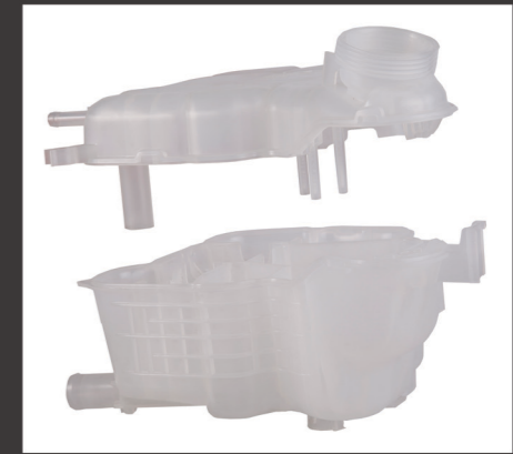
SURGE TANK ZAFIRA

Client: Renault Dim.Mold. (2X) 1640 x 975 x 908