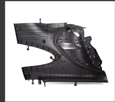
COVER FRAME REAR RH

Client: Peugeot / Citroën Dim. Mold: 1278 x 896 x 920