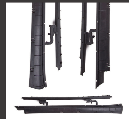
BELT REINFORCEMENT LH+RH

Client BMW - MINI Dim.Mold. 1610 x 991 x 1100