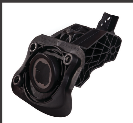
CHAPE DÉBRAYAGE DAG – BVH2

Client: Peugeot / Citroën Dim. Mold: 1290 x 1015 x 920