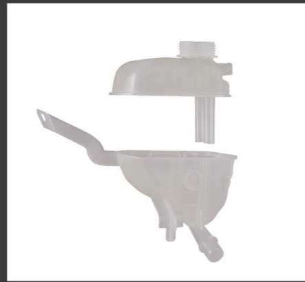
BOITE DÉGAZAGE W2 –PF3

Client: Renault Dim. Mold: 2246 x 696 x 864