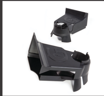
PROTECTEUR FILTRE À AIR GAUCHE DV6

Client: Nissan Dim. Mold: 1063 x 780 x 1082