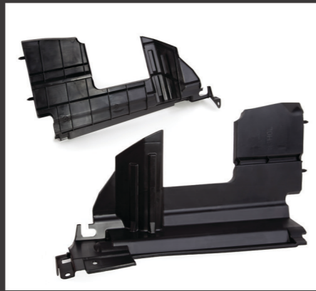
GUIDE AIR FR RH + RF LH

Client: Nissan Dim. Mold: 1063 x 780 x 1082