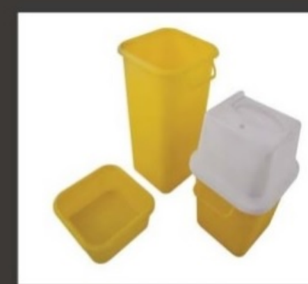
BOITE À SERINGUES