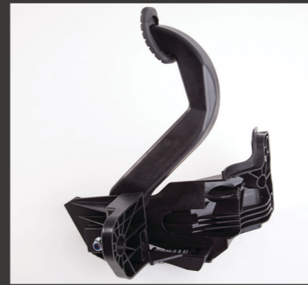
CHAPE DE DEBRAYAGE PEDALIER

Client: Barre Thomas Dim.Mold: 1164 x 725 x 680