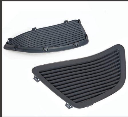
BULD COVER PTSS

Client: BMW - MINI Dim.Mold: 1610 x 1150 x 900